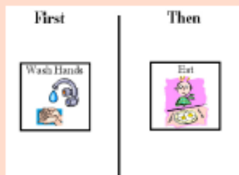
Microsoft Clipart® pictures on a simple 2 step transition "First/Then" board.