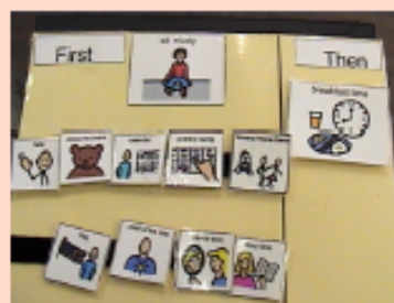
Schedule pictured on the left side represent activities within circle time, then the bold line represents the transition to the next place.