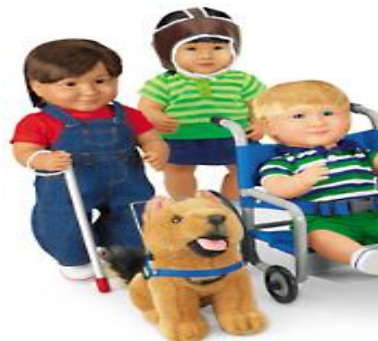
Include labels and toys that represent children with disabilities.