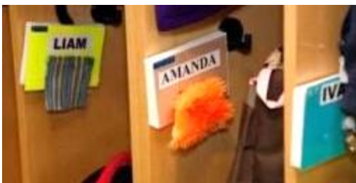
Use tactile labels for cubbies, personal items, and storage bins.