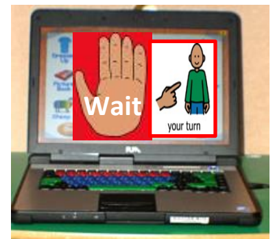
Use labels to indicate when specific centers and activities are not available. This strategy is especially useful for favorite class areas such as the computer center.