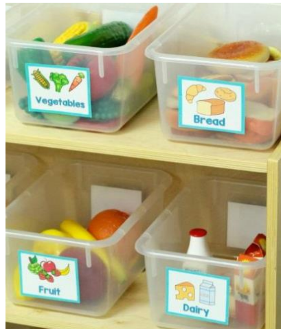
Labels on bins support children during clean-up activities. The labels also support learning skills in classification.