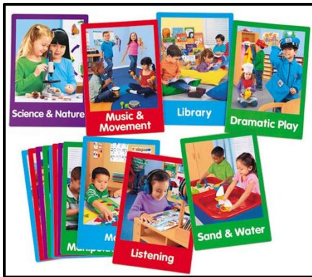
Label centers and activity areas with drawings and photos showing ideas of types of actions that occur in the areas.