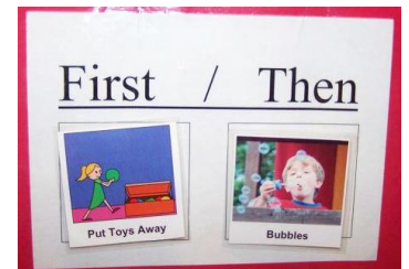
Post first/then and mini-schedules to support transitions.