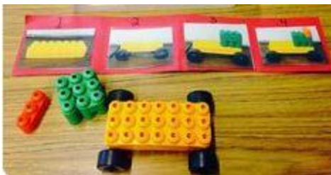
Include mini-schedules to provide ideas for children who have difficulty with pretending or with initiating play.