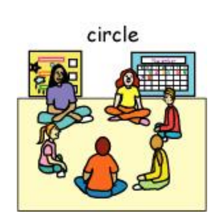
1. Sit in your area