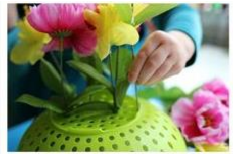
fine motor tray

Using a spinner or other turn-taking method provides practice in motor movement.