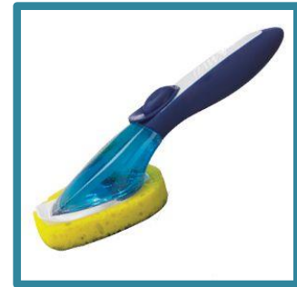
Sponge dish scrubber

Examples: brush holders from household items: foam inside tissue roll, tennis and Styrofoam balls, and plastic pipe joints. Other examples show brush holders that are available for purchase and brushes with various sizes and grips of handles.