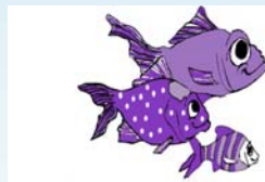
Getting to Know Me & My Family