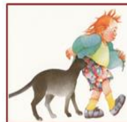
First – "at the beginning"

Keep the pages of the book available as cues for first/next/last. Start with actual pages and then use corresponding but different photos.