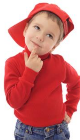
Response to a choice with "you decide".