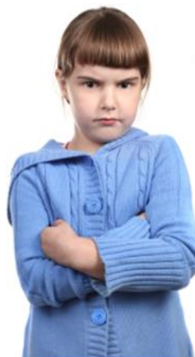
Response to a command.