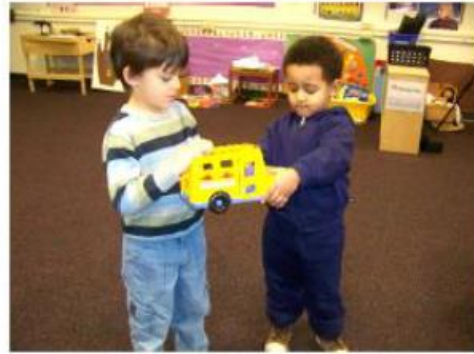
I can give my friend a toy that I want to share.