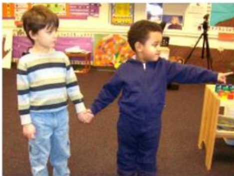
I can gently take my friend by the hand.