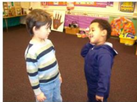
I can say "let's play!"