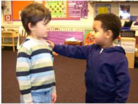
I can tap my friend on the shoulder.