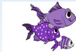
Getting to Know Me & My Family